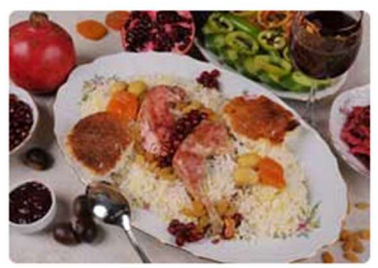
Nardancha Pilaf (Pomegranate Seeds Pilaf )