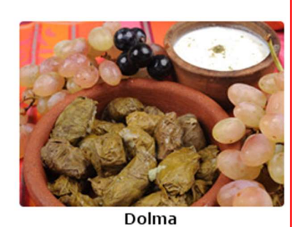
fs Meat dishes