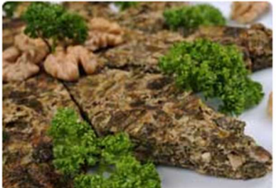
Dishes with vegetables and greens