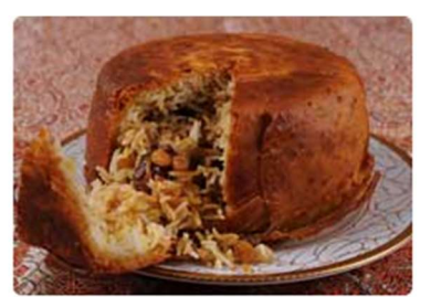
Shah Pilaf (Crown Pilaf )