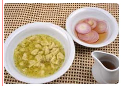
Dyushbara (Meat Dumplings)