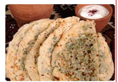
Greens & Meat Gutab