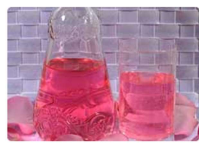
Rose Petals Sorbet