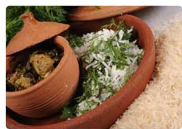
Shuyud plovu (pilaf with dill)