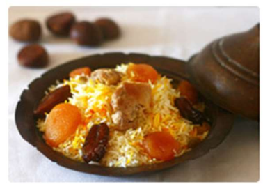
Fisinjan Pilaf (Pilaf with Meat and W alnuts)