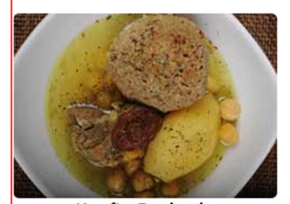
Kyufta Bozbash (Minced Meat Bozbash)