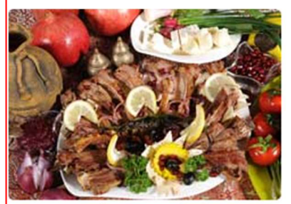
Gabyrga Kebab (Entrecote Barbecue)