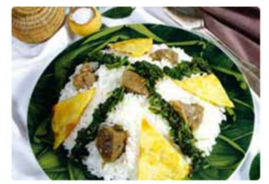
Sabzi-Govurma Pilaf (Pilaf with Stewed Meat and Greens)