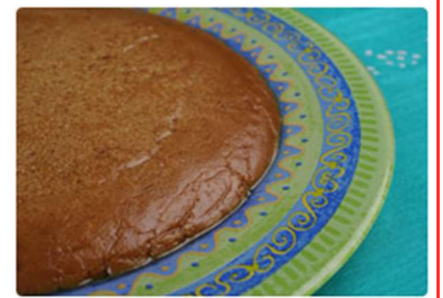
Sweets and desserts