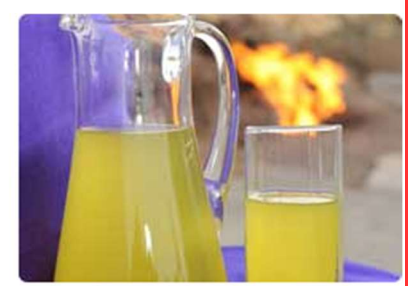
Sorbet with Lemon Crust