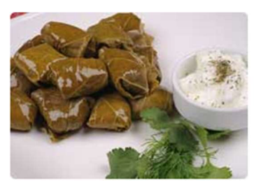
Yarpag Dolmasy (Vine Leaf Dolmah)